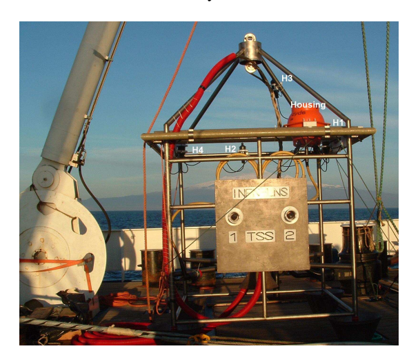
Figure 1. The titanium frame installed on TSS. The ROV operable electro-optical connectors are visible on the front panel. The hydrophones and electronics housing of the O\nu DE station are also shown (see text). The frame height is about 3.5 m)

bandwidth) reach the same A/D stereo board, H2 and H4 (hipass filtered) the other one. The two A/Ds are driven by the same clock: the four signals are, then, synchronized. The CS5396 samples the analog data at a rate of 96 kHz with 24 bit resolution. The digital outputs of the two A/Ds (in standard SPDIF) are sent to two fiber optic data transmitters. A tilt-meter and compass board is also installed inside the glass sphere to measure the absolute orientation of the frame and continuously monitor possible movements of the station. Optical data are reconverted, on shore, into SPDIF protocol by two fiber optic receivers and, then, acquired using two PCI audio boards RME DIGI96-8 PAD (96 kHz, 24 bits) mounted on a PC, Pentium4 3GHz. Power is supplied from shore using stabilized 220 VAC supplier and transformed to \sim 405 VAC in order to feed the underwater station constantly at 380 VAC. The station power consumption is roughly 30 W. On January 22^{nd} 2005 O \nu DE was deployed together with the TSS frame and then connected and switched on. The orientation of the frame front with respect to North is \sim 110°, measured both by the ROV and the on-board compass.