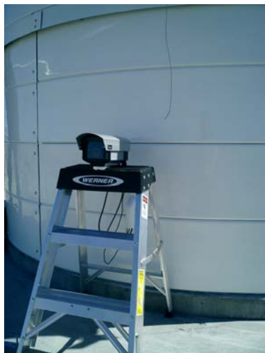
Figure 4. The CCD cloud monitoring system installed at Black Rock Mesa

We also monitor the cloud condition so that the cloud region effects observing fluorescence light from cosmic ray to the fluorescence detectors. The cloud monitoring system consists of a well PC controlled CCD image sensor which observe cloud in the night. FOV of the CCD camera is approx. hundred degrees in horizontal and vertical direction using an fish eye lens. A sensitivity of CCD is less than 0.001Lux.