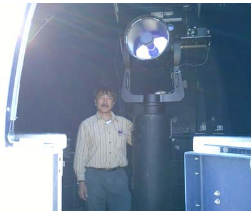
Figure 3. The LIDAR system installed at Black Rock Mesa