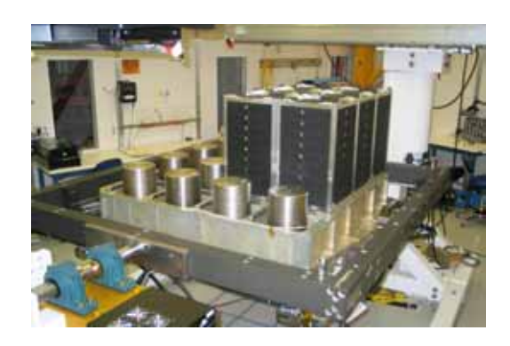
Figure 3 LAT Integration in process (as of June 2005)

As of June 2005, LAT is in Integration and Testing at SLAC. All LAT components are basically ready for integration into LAT. Figure 3 shows LAT in the process of integration, with 6 towers installed and tested. The aluminum cylinders are mass simulators, to be replaced by the remaining towers. Completion of LAT integration and testing is expected in early 2006, followed by environmental testing.