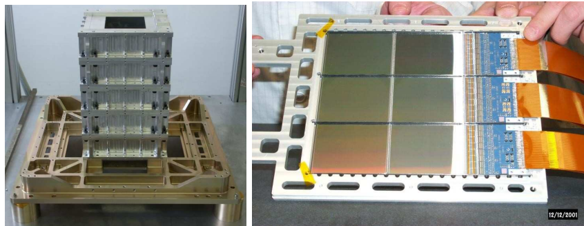
Figure 1. Left: view of the magnetic tower mounted on the base plate. Right: view of a tracker plane.

The main challenge of the experiment was the use of advanced detection techniques, developed for the high-energy physics, on board of a satellite. In particular, the main novelty is the installation of a magnetic spectrometer based on a microstrip silicon tracking system, which compared with traditional gas detectors provides a spatial resolution of more than one order of magnitude better. This allows a precise measurement of particle