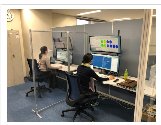
Figure 3: Remote LST operation room at ICRR, 3<sup>rd</sup> floor.

COVID-19. Triggered by the pandemic we developed a safety and operation concept